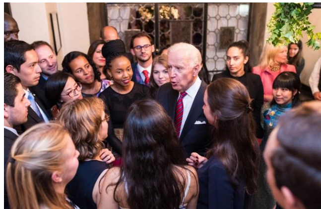
2017 Honoree: Former Vice President, Joseph R. Biden Jr speaking with ISH-DC resident scholars