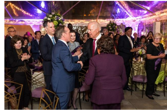
Former Secretary David Shulkin, Congresswoman Nita Lowey, and former US Vice President Joseph R. Biden Jr.