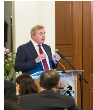
2017 Diplomatic Chair, Ambassador Kim Darroch, addressing guests at the Tribute