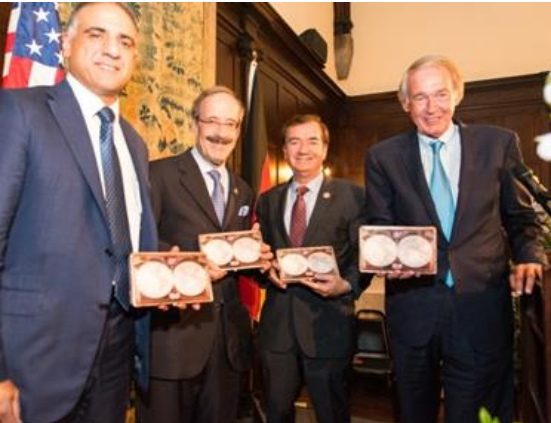
2016 Honorees: AI-Monitor; Congressman Eliot L. Engel; Congressman Ed Royce; and Senator Ed Markey