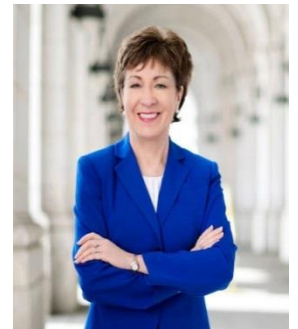
Senator Susan Collins

The Diplomatic Chair, Ambassador Gérard Araud of France will host a special Tribute Dinner at his Embassy Residence for our major sponsors and special guests in early 2019. The Tribute Dinner celebrates the special relationship between the United States and France. ISH-DC has played an exceptional role in supporting this partnership. Since our founding, ISH-DC has welcomed hundreds of resident scholars from France to the House.