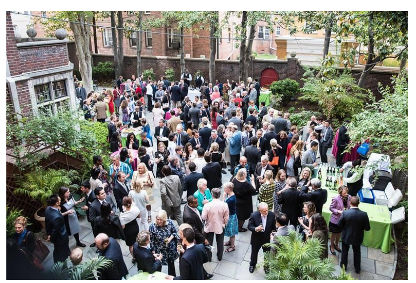
Guests enjoying the Garden Party

On Thursday May 14 we welcomed more than 200 guests including foreign Ambassadors, Members of Congress, alumni, and supporters to the House for our Annual Garden Party. The event celebrated not only our refurbished garden but also the life-long connections our alumni, residents, and friends have created with each other and the House.