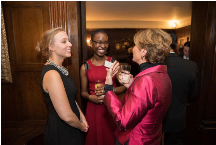
ISH-DC Residents, Dr. Anne-Marie Slaughter