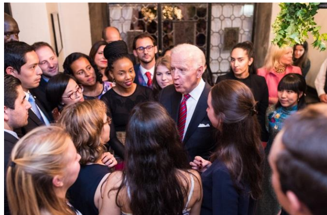
2017 Honoree: Former Vice President, Joseph R. Biden Jr speaking with ISH-DC resident scholars