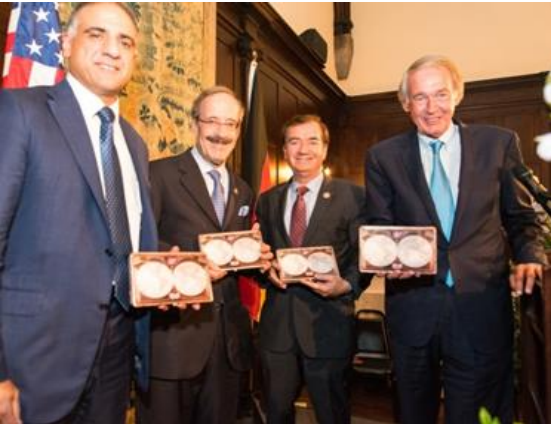
2016 Honorees: AI-Monitor; Congressman Eliot L. Engel; Congressman Ed Royce; and Senator Ed Markey