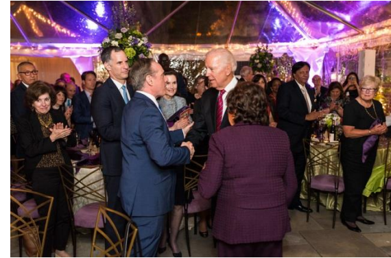
Former Secretary David Shulkin, Congresswoman Nita Lowey, and former US Vice President Joseph R. Biden Jr.