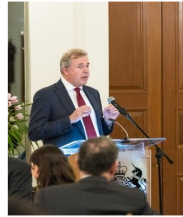
2017 Diplomatic Chair, Ambassador Kim Darroch, addressing guests at the Tribute